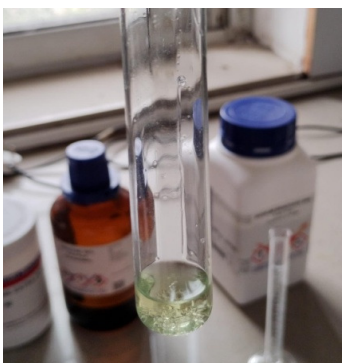
Fig 1: Ph test of Salicylic acid.