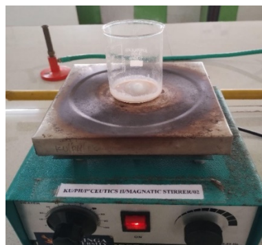
Fig 5: Mixing nano API and