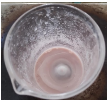
Fig 4: Nano emulsion Gel.