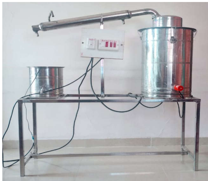
Figure No: 2, Actual Model of Extraction Unit

The diagram of experimental setup is shown below. The experiment was conducted in a Stainless Steel Extraction Unit. It consists of one round steel drum of dome shape structure capacity of 50 lit approx which have heating coils inside to heat, which is then connected with steel pipe which goes through one end of condenser which is used for cooling the formed steam and then from other end of condenser the water droplet receiving pipe is connected from which cooled water droplet is goes and collected in collecting drum. The thermostat is also used for measurement of rising temperature of boiling unit And cooling water unit is separated connected at bottom side which supplies continuously cooled water to condenser for cooling the steam. This unit is connected to condenser from two point, one is input and other is output. From input point the cooled water is supplied to condenser to cool down the steam and from output point the heated water is collect out in cooling Drum, then this heated water is again get cooled in cooling drum and it again supply to condenser, this process is happen continuously. The separating funnel is used for the separation of essential oil and extract water.